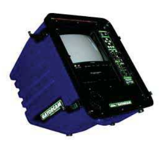
Control Box Viewed at 45°