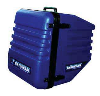
Rugged, Control Box