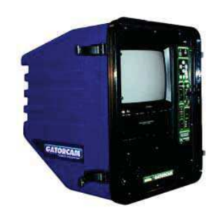
Control Box Viewed Upright