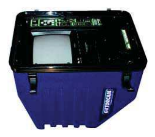
Control Box Viewed Flat