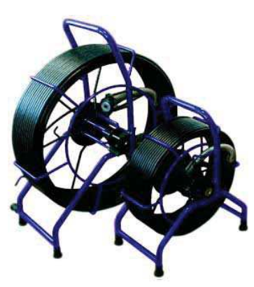
A range of cable lengths (Standard or Mini)

The Standard Cable Reel and the Mini Cable Reel both interface with a compact and portable control box. The control box allows the operator to view the image as seen by the camera. The operator can even video-tape the complete inspection process if required. The operator also has the facility to title the video-tape with address/location details and date/time information.