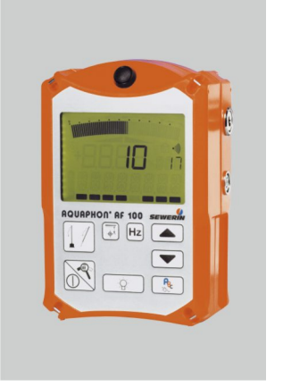
AQUAPHON® AF 100 Combi device for electroacoustic water leak detection and pipeline location